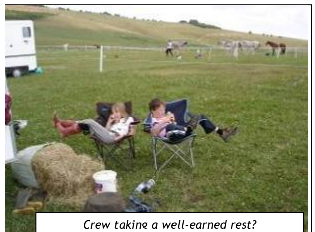
Crew taking a well-earned rest?