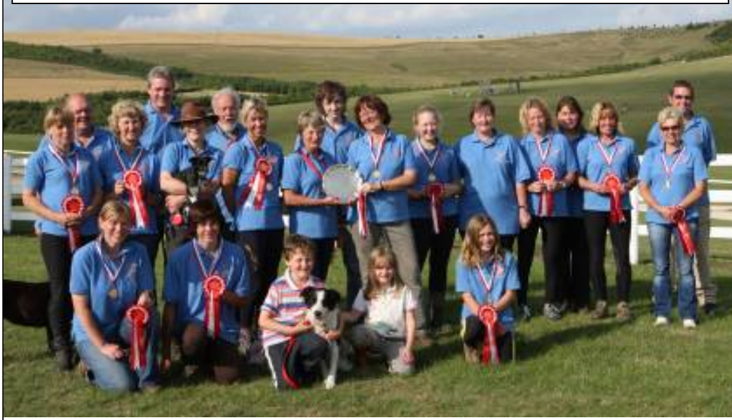
The blue army - Uncle Tom Cobley & all. Crews, kids & dog... oh, and riders!

The journey home flew by (probably aided by the cans of gin and tonic I consumed)! Harvey again travelled well and didn't seem at all phased to be turned back out with his friends at 10pm at night. None of this would