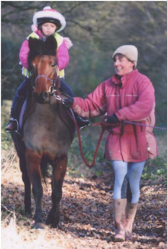
Me on my pony Poppy with Mummy leading me